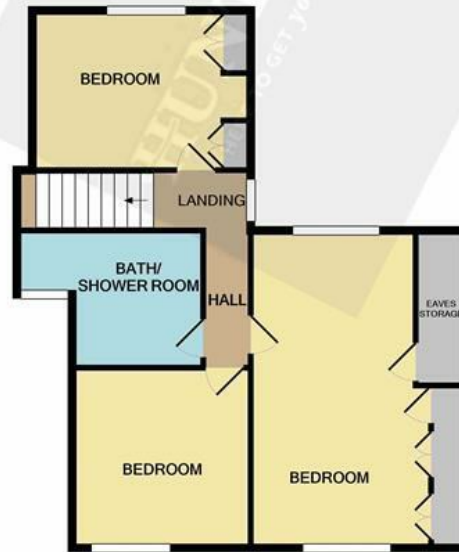
1ST FLOOR APPROX. FLOOR AREA 547 SQ.FT. (50.8 SQ.M.)

TOTAL APPROX. FLOOR AREA 1375 SQ.FT. (127.7 SQ.M.)